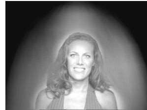
Individual Headshot of Aura

The Aura is the electromagnetic energy field surrounding living organisms. This field vibrates at different frequencies and reflects one's state of Body, Mind & Spirit.